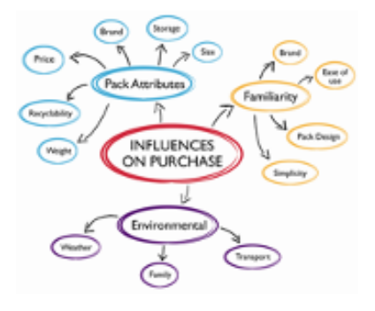
Figure 7. Influences on purchase .