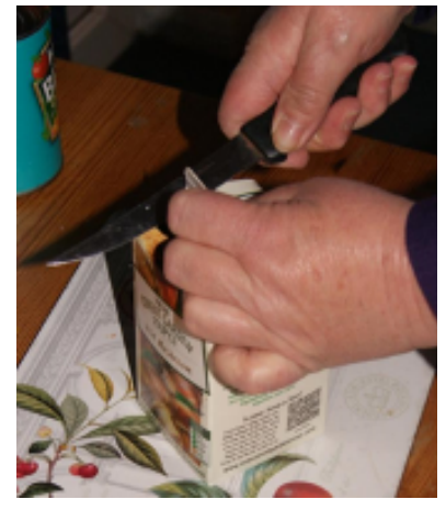
Figure 1. Older adults requiring fine manipulation to access a pack. Source: author's image.

Figure 2. Older adult using knife to open packaging. Source: author's image.