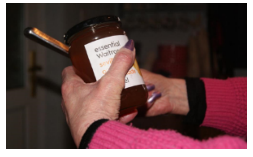
Figure 6. Percentage of the test population using specific tools to open jars.